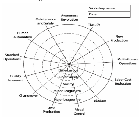
Figure 1: Lean Production Radar Chart

These 13 factors are considered to cover all the principles of Lean implementation in a production firm. These factors are quantified through 5 levels of lean adoption: little league (level 1), junior varsity (level 2), varsity (level 3), minor league pro (level 4), and major league pro (level 5). The Hirano's measures and levels are shown in the figure 1.