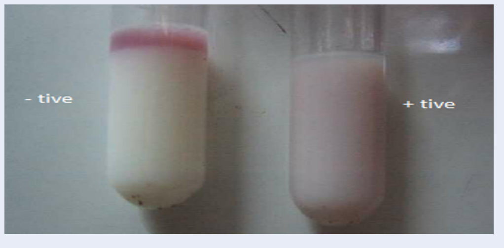
Figure 1: Milk ring test result.