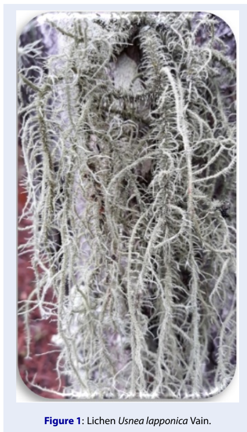
Figure 1: Lichen Usnea lapponica Vain.